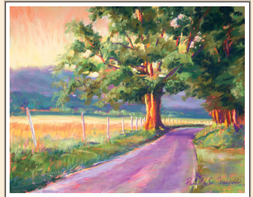
Cades Cove 20 x 16