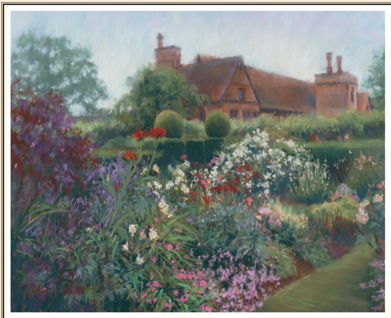
Elizabeth's Garden, Hatfield House 20 x 16