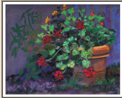
Red Geranium 14 x 11