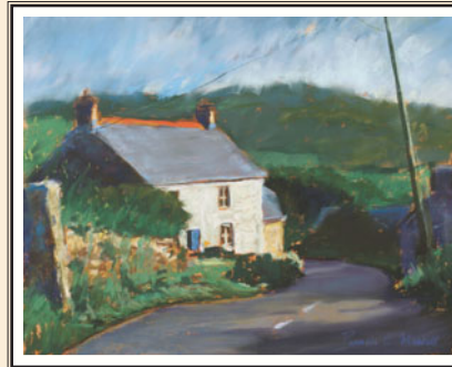
Road to Land's End 14 x 11