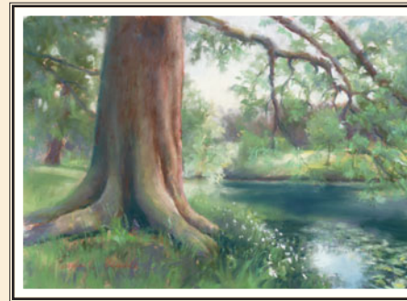
Sentinel Oak 14 x 10