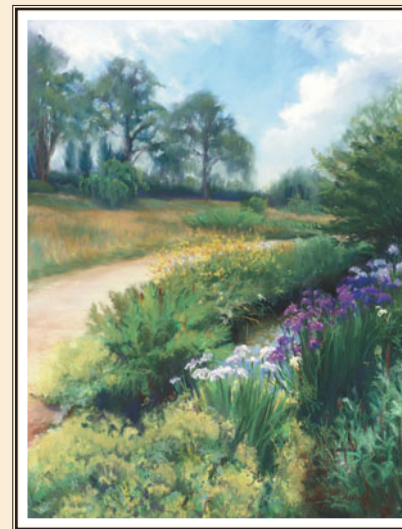
Garden At Wisley 18 x 24