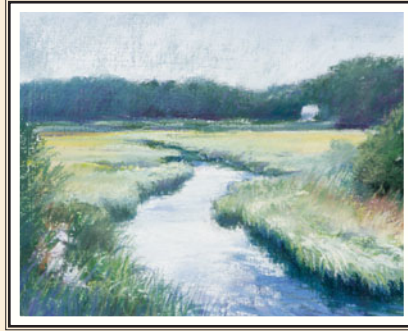
Salt Marsh 9 x 7