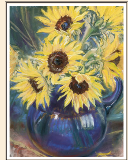
Sunflowers, Blue Vase 11 x 14