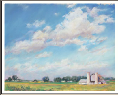
Fair Skies 14 x 11