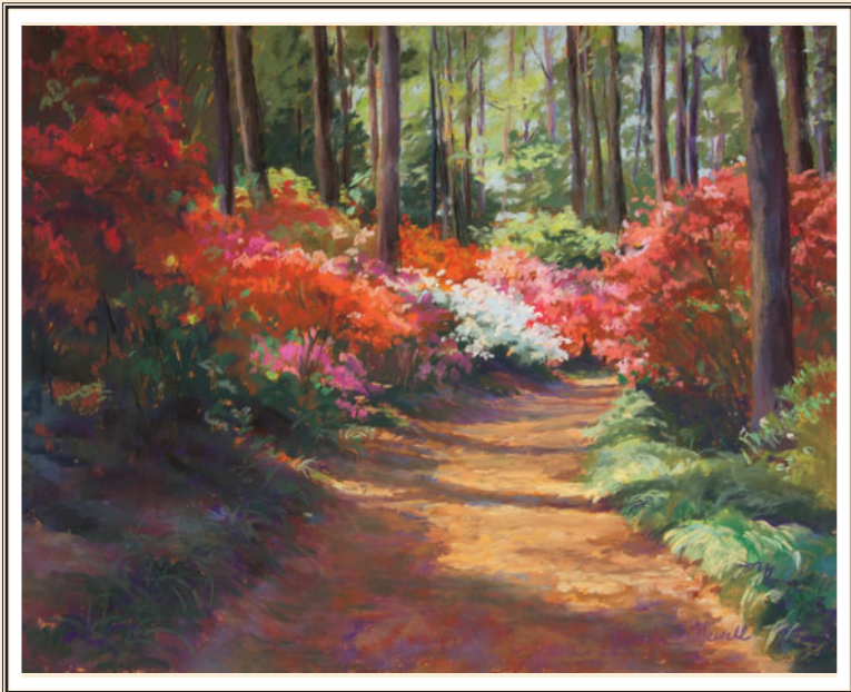
Callaway Spring 20 x 16